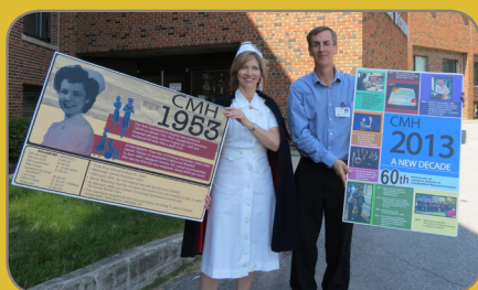
Celebrating our 60th anniversary.

We are continuing to share our story with our community and the broader health care community and are proud to highlight we successfully completed the National Accreditation process and was awarded Accredited with Exemplary Standing, the highest level awarded by Accreditation Canada.